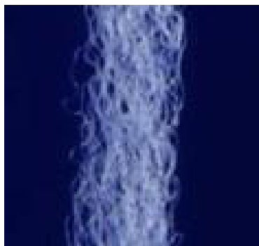
75D/144F MICRO-DRI Yarn

Crest Link keeps the golfer dry after a round in hot and humid weather. Thanks to MICRO DRI's wicking process, the golfer remains cool in hot climates. Crest Link apparel comes in many new and trendy colours with dynamic designs to suit all golfers.